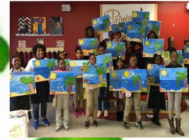
Henry V Adams Elementary 3 rd graders are showing off their artwork piece "At the Beach with Van Gogh"