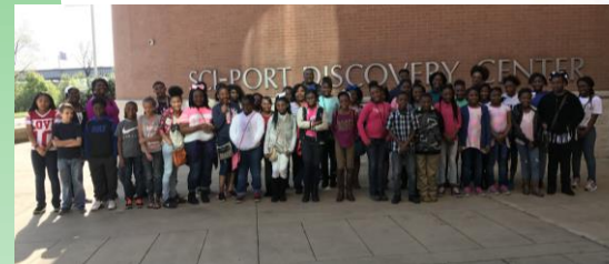
Morehouse Junior High students visited SciPort on March 25, 2017