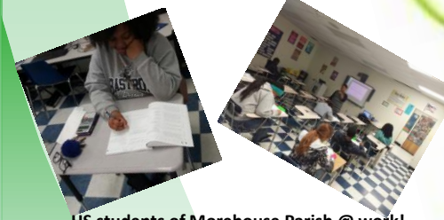
HS students of Morehouse Parish @ work!