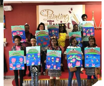
Morehouse Junior High and Bastrop High School students are showing off their artwork piece "At the lake with Monet"