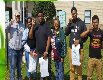
Bastrop High School students toured LA Tech campus and learned about admissions, scholarships, and living on campus.